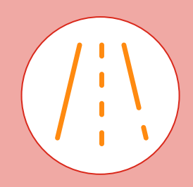
*As of January 2025